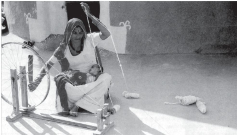
After disposing house hold work, a woman engaged in spinning yarn