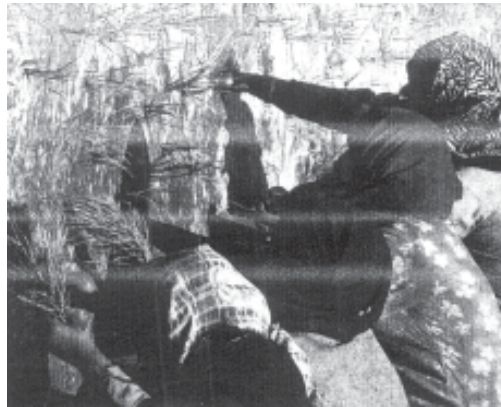
Women working in field in large number, showing disguised unemployment