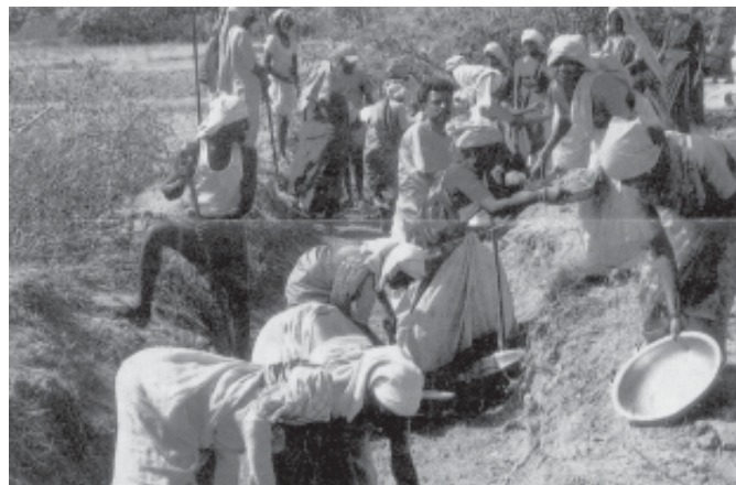
People working under NREGA