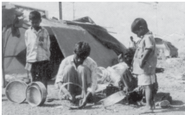
People engage in other work in the hope of employment

Indian agriculture is a seasonal occupation. As farming activities are divided into different phase like planting, irrigating, weeding, harvesting , etc. and after each phase the labourers become jobless, because the farmers have no alternative work in this period and this is situation that creates seasonal unemployment.