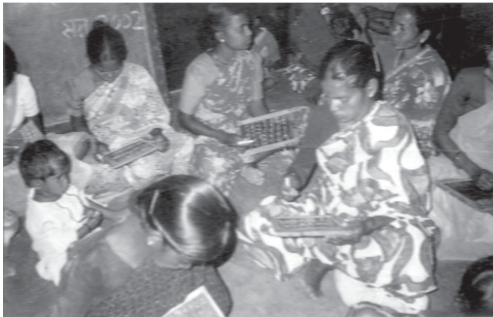
Unskilled and illiterate women pursuing education